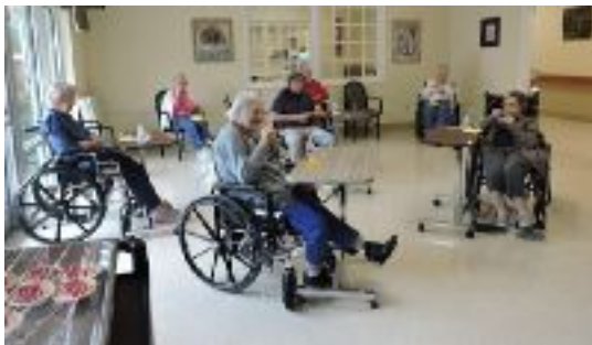
Practicing social distancing