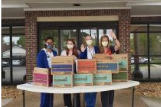
Thank you to Troop 684 Crew for their donation of Girl Scout cookies.