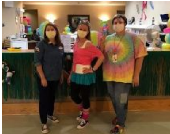
'70s day during National Nursing Home Week