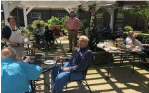
Brookview men enjoyed a cookout on the patio.