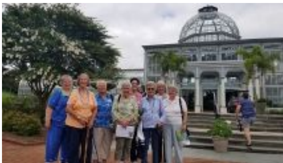
Lewis Ginter Botanical Gardens