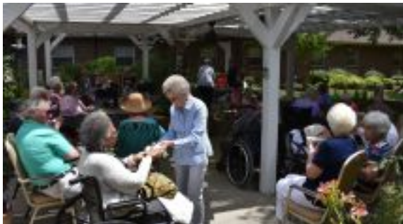
Courts & Brookview residents enjoy homemade ice cream.