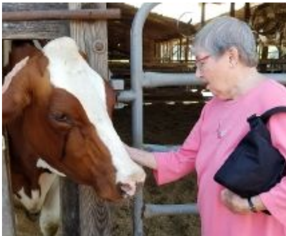
Richlands Dairy Farm & Creamery