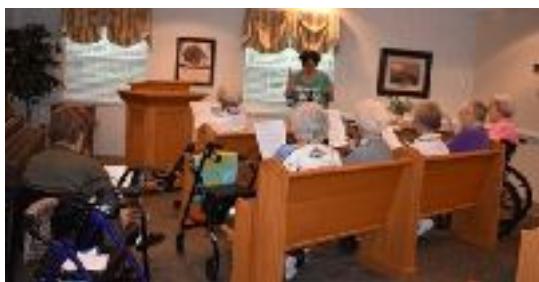
Brookview choir practicing