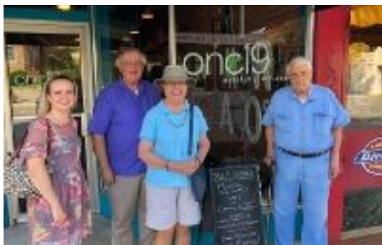
Dining out at the new restaurant, One19, in Farmville