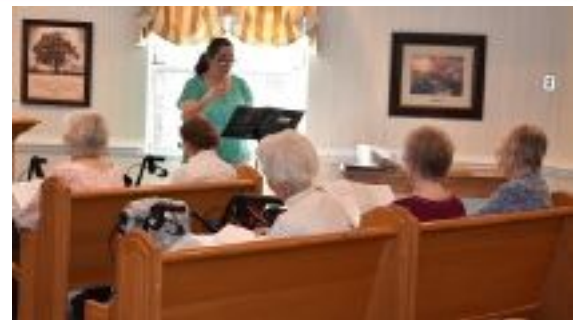
Brookview Choir practicing