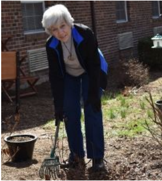
Ms. Akers clearing out for spring.

Being around trees has been shown to make people feel calmer and happier.