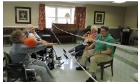
Volleyball at Holly Manor