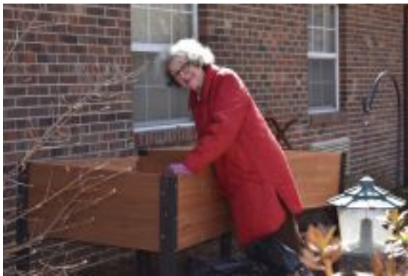
Cleaning up for Spring