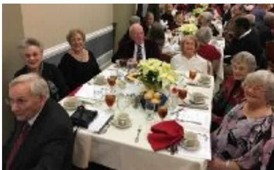
Annual Longwood Christmas Dinner