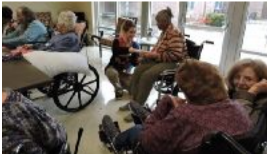
Meaningful Life Program