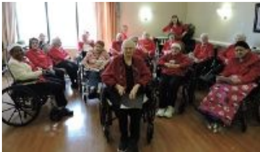
Holly Manor Hand Bell & Singing Choir performed for the residents.