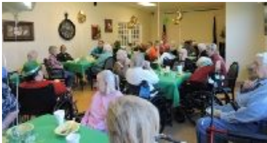
St Patty's Day Celebration