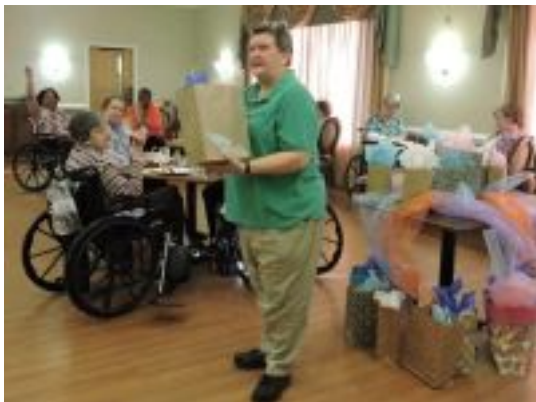
"Pumpkin" auctions off gifts