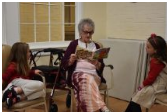
Brookview residents participated in their 1st ever Intergenerational Reading Program with Fuqua students.