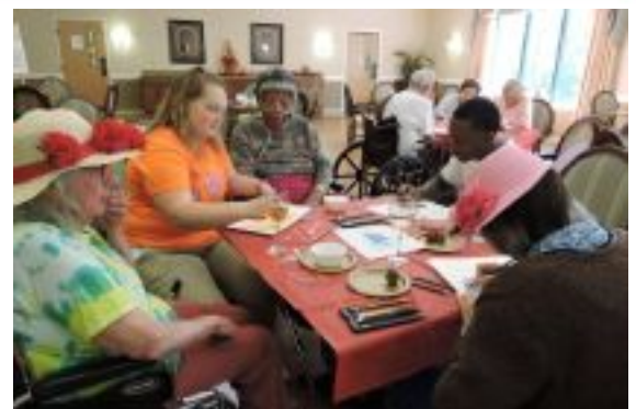
Residents & volunteers enjoying doing watercolor