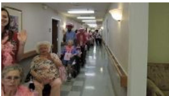
Pretty in Pink Parade