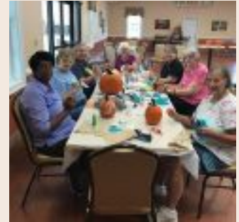
The Courts residents decorating pumpkins for fall