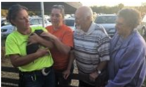
Checking out the baby pig