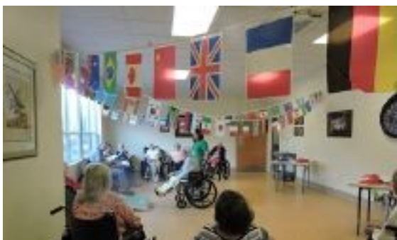
Summer Olympics held at Holly Manor