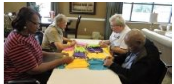
Tie knot Afghan