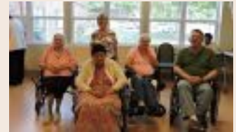
Bowling tournament winners