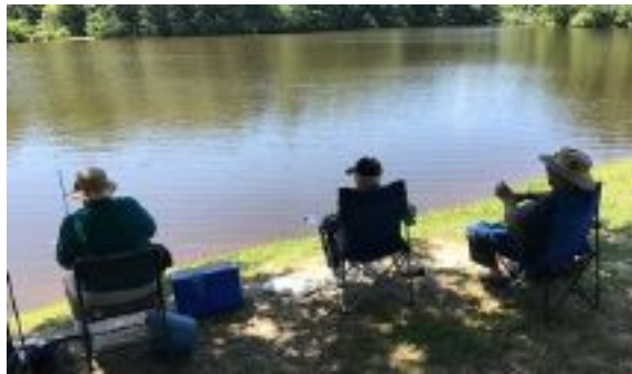
Lazy afternoon of fishing.