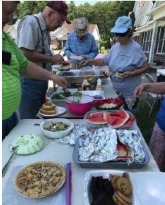
Courts residents enjoying a picnic.