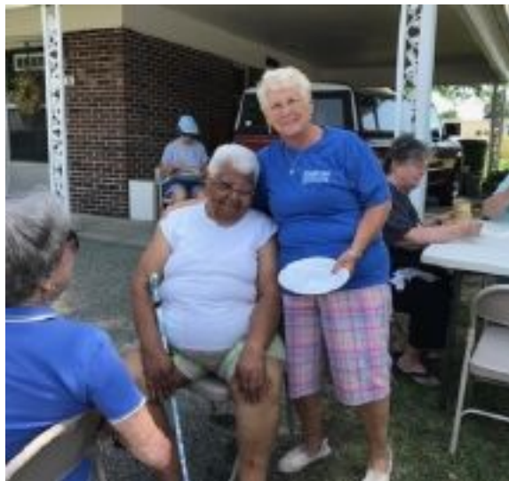
Good friends and Good food.