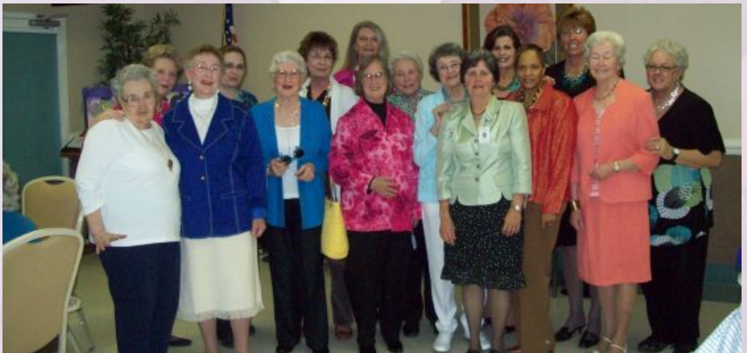
Woodland Fashionistas, residents and staff, modeled pretty spring clothing and accessories from The Woodland Boutique, while residents enjoyed delicious treats during the "Decked Out and Dessert" Tea.