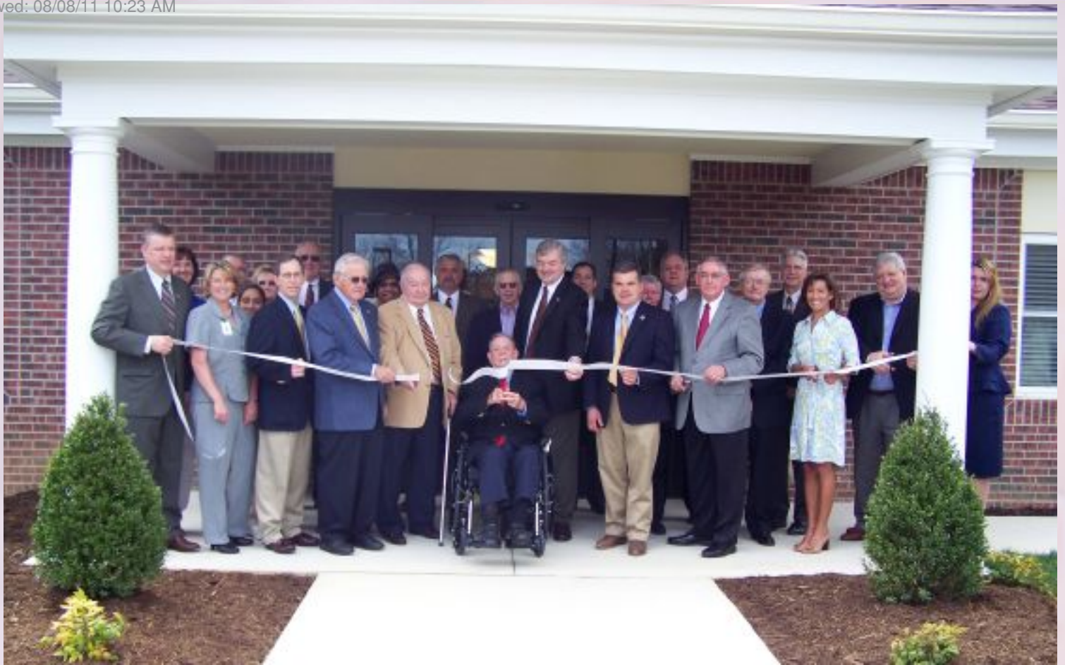
Grand Opening of the Brantley Wing and the Watkins Wellness Center